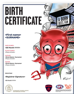
All 18 AFL clubs

You can purchase an additional commemorative birth certificate — there are lots of designs to choose from! Each certificate is printed on archival-quality paper, and fits a standard frame size of 280x355mm (11"x14").